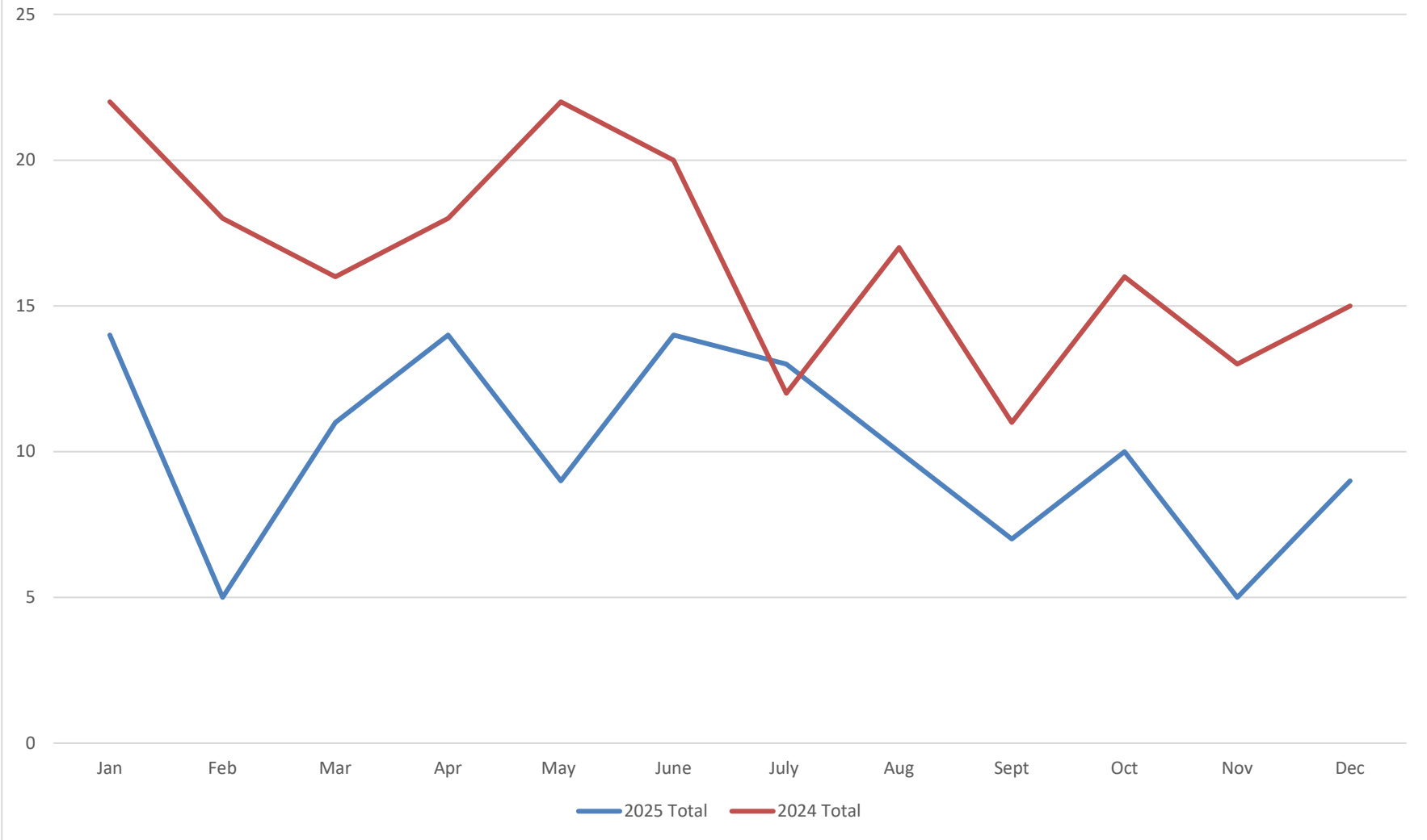
2024/2025 Part I Comparison